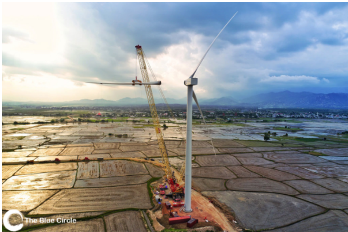
One of the wind turbine under construction

E uroCham supported the creation of the first Wind Energy Association in Cambodia (WeaCam) in order to continue advocating for green businesses in the Kingdom. The positive opening remarks from H.E. Victor Jona , Director General of the General Department of Energy, Ministry of Mines and Energy have mirrored the way forward toward a greener energy commitment, reducing carbon emissions to zero and looking forward to more renewable energy investment. The main supporting partners in establishing this WeaCam are WWF, 3i Cambodia, IES Australia, Energy Lab, H&M, GGGI, GE Renewables, and EuroCham Cambodia.