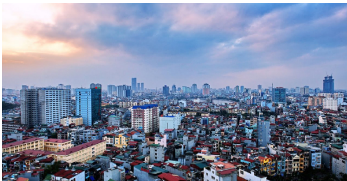
Phnom Penh Landscape

O n 14 November, the Royal Government has decided to lift quarantine measures for all inbound travellers (Cambodians and foreigners) who have been fully vaccinated. However, they are still required to bring their official COVID-19 vaccination certificate, and a negative COVID-19 PCR test certificate (72 hours before arrival) and have to undergo a rapid (lateral flow) test upon arrival (results are given immediately).