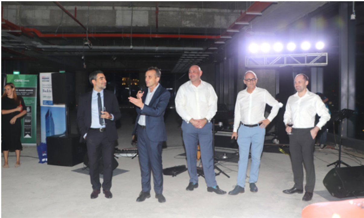
EuroCham Real Estate and Construction Networking Night at Sathapana Tower (19 floor)

O n 12th November 2021 at Sathapana Tower, EuroCham and our Real Estate & Construction Committee hosted a networking event “Back to Business”. We welcomed over 80 participants.