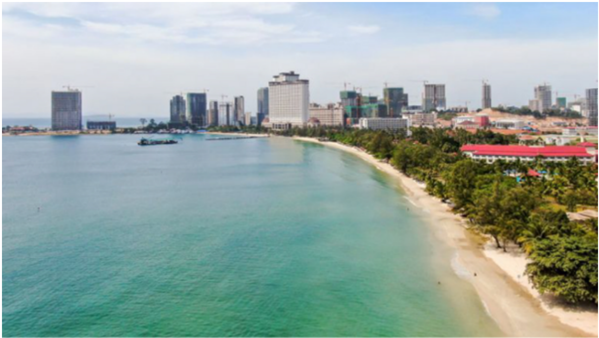
Sihanoukville's beach, Cambodia

T he General Department of Policy of the Ministry of Economy and Finance announced its plans and goals for the Preah Sihanouk Special Economic Zone (SEZ). Officials from the department held a meeting to discuss the master plan and goals for the Preah Sihanouk SEZ on the afternoon of November 12.