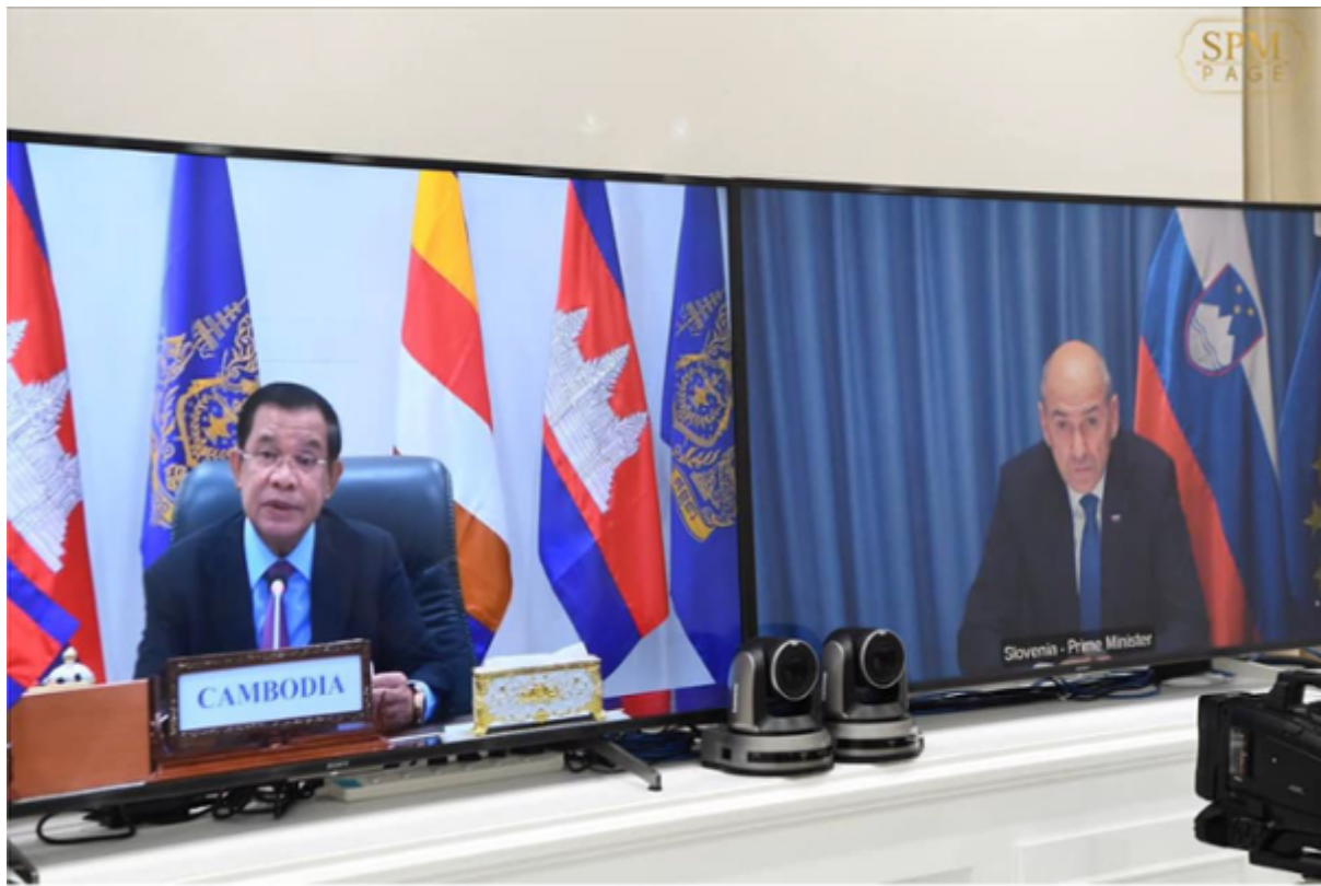
Prime Minister Hun Sen virtual meeting with Slovenian Prime Minister Janez Jansa

T he Kingdom of Cambodia and the Republic of Slovenia have agreed to further foster their cooperation in potential areas, including economy, trade, tourism, health and other sectors.