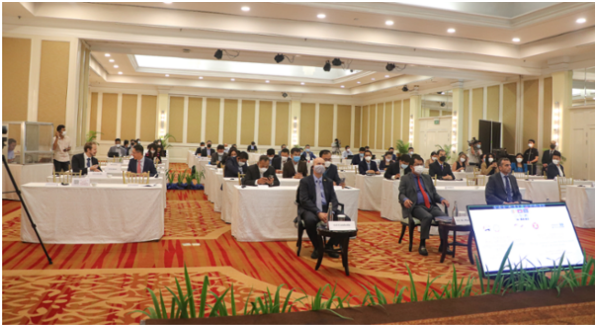
National Conference on Consumer Protection at Raffles Hotel Le Royal

On 11th November, EuroCham co-organised the National Conference on Consumer Protection: Driving Cambodia Consumer-First Environment, through hybrid mode via Zoom and at Raffles Hotel Le Royal. The event was organised with the Consumer Protection, Competition and Fraud Repression Directorate General (CCF) under the Ministry of Commerce (MoC), and with the support of the GIZ Consumer Protection in ASEAN (PROTECT) project .